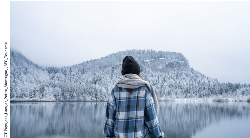
OT Pays des Lacs et Petite Montagne_BFC Tourisme

For a top-of-the-range stay, spend the night at one with nature in a pod-style igloo in Pralognan La Vanoise , or in a bubble beneath the stars at the Cians campsite in Beuil (Alpes Maritimes).